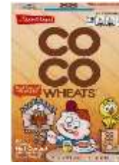
Co Co Wheats