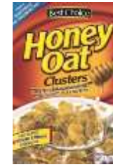
Honey Oat Clusters