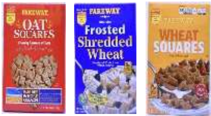
Crunchy Oat Squares Frosted Shredded Wheat Wheat Squares