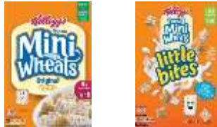
Frosted Mini Wheats Frosted Mini Wheats Little Bites