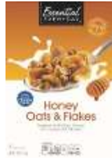
Honey Oats & Flakes