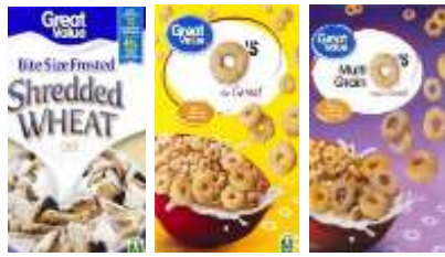
Bite Size Frosted Shredded Wheat O's Multi-Grain O's