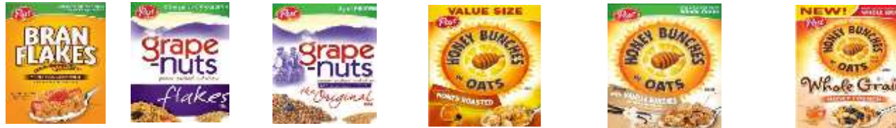
Bran Flakes Grape Nuts Flakes Grape Nuts Original Honey Bunches of Oats Honey Roasted Honey Bunches of Oats with Vanilla Bunches Honey Bunches of Oats Whole Grain Honey Crunch